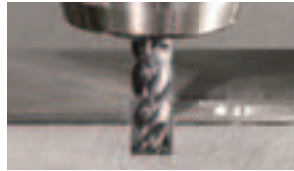
Solid Carbide Endmill